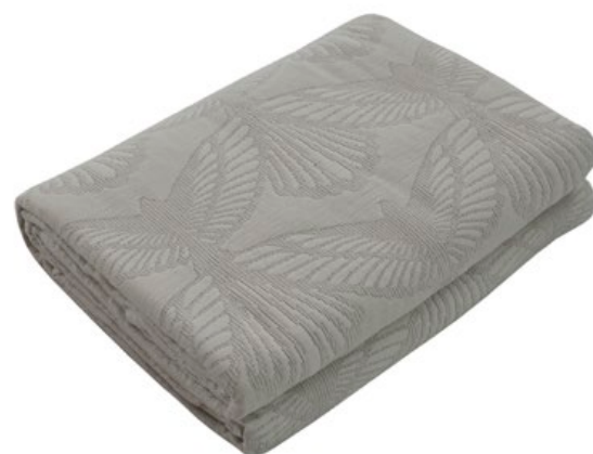
215 - Ecru