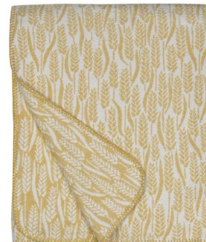
289 - Hay yellow