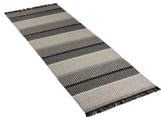
222, 223, 224 - Warm grey