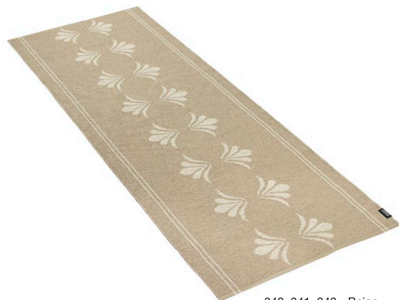
340, 341, 342 - Beige