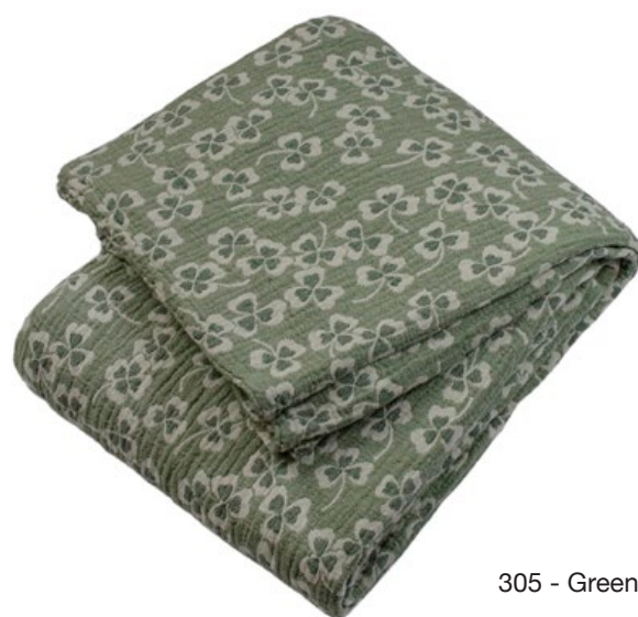
305 - Green