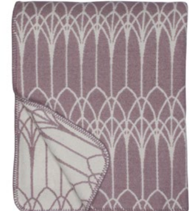
323 - Mauve pink