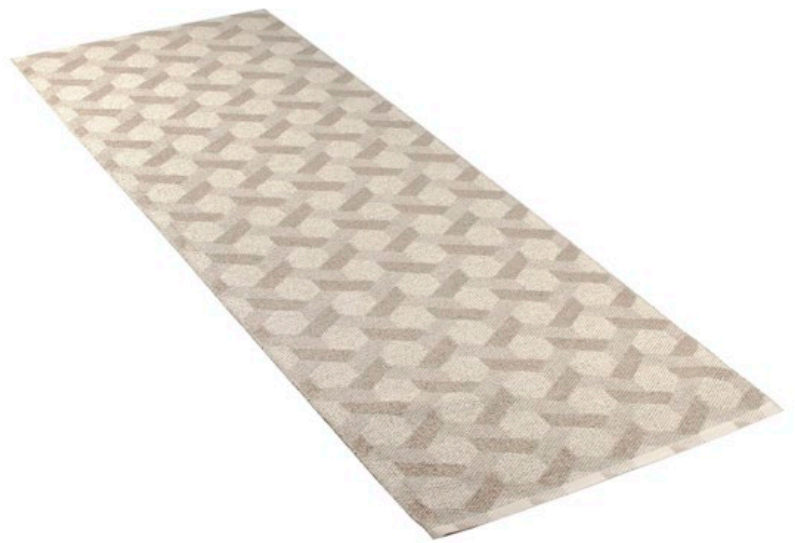
251, 252, 253 - Creme/nougat