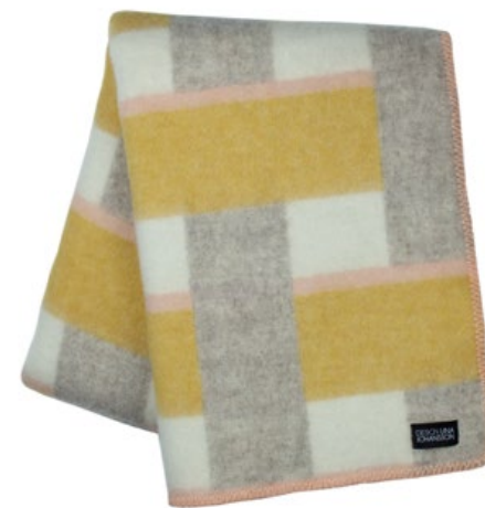
361 - Yellow/pink/greige