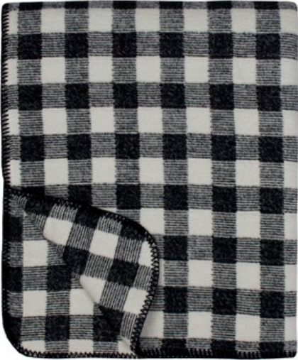
349 - Black