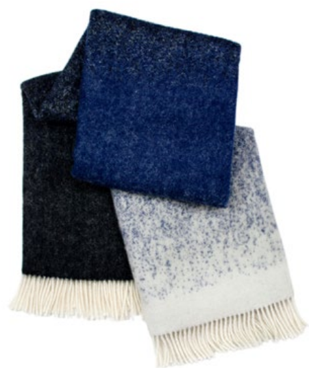
364 - Blue