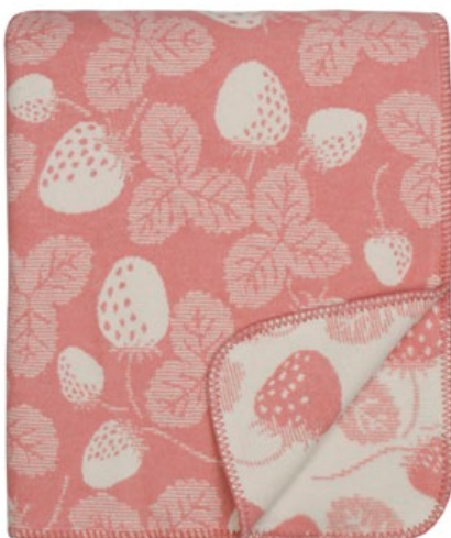
347 - Pink