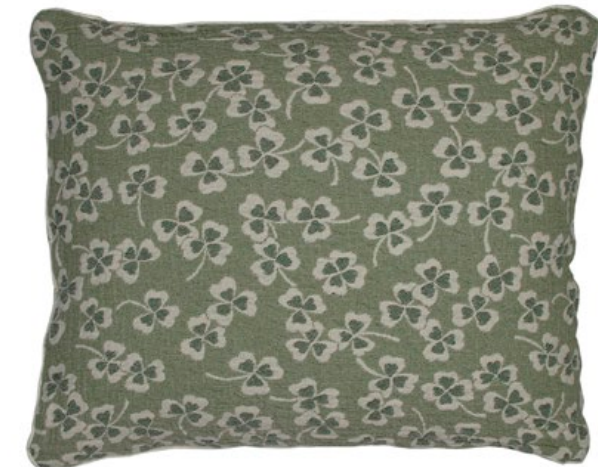
310 - Green