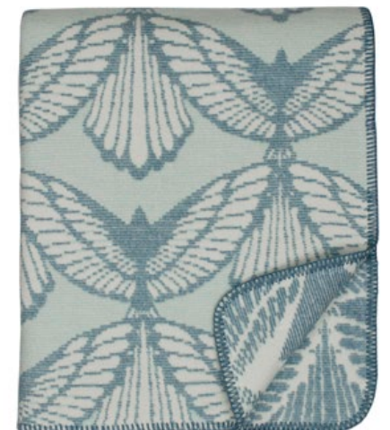
315 - Aqua