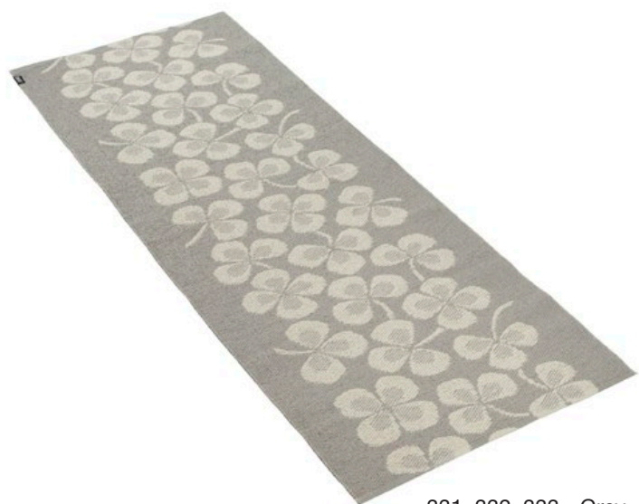
331, 332, 333 - Grey