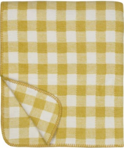
352 - Yellow