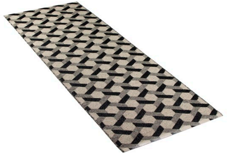
245, 246, 247 - Creme/black