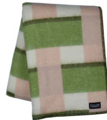
363 - Green/pink