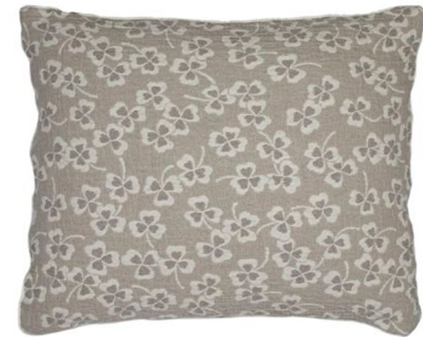
308 - Grey/beige