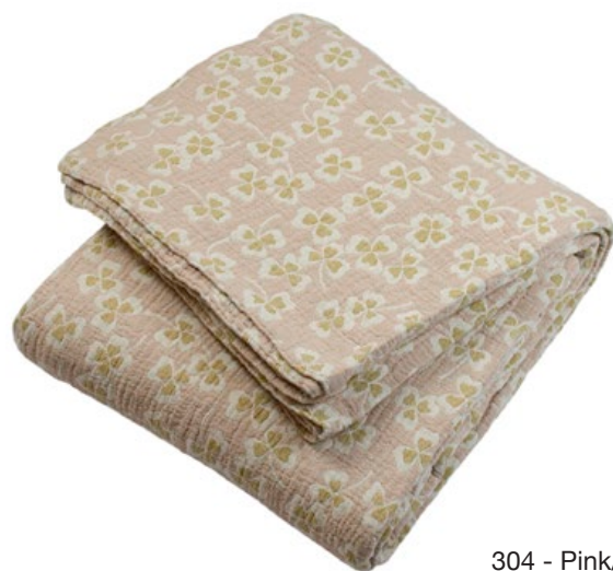
304 - Pink/yellow