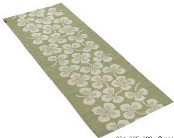
334, 335, 336 - Green