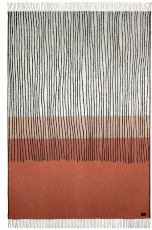
244 - Rosehip