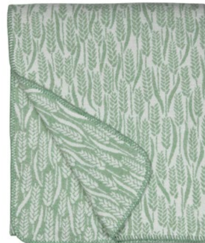
290 - Mint green