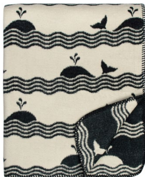
359 - Black/creme