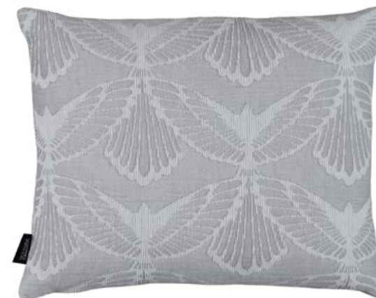
219 - Ecru/grey