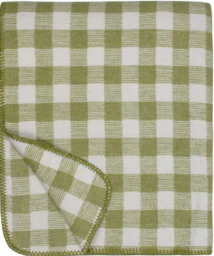
350 - Green