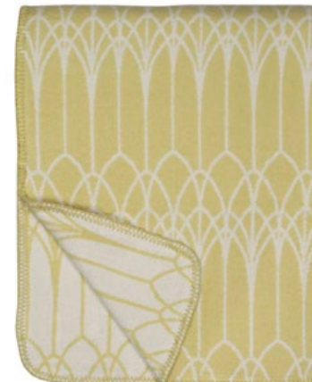
322 - Soft yellow