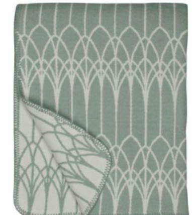
320 - Misty green