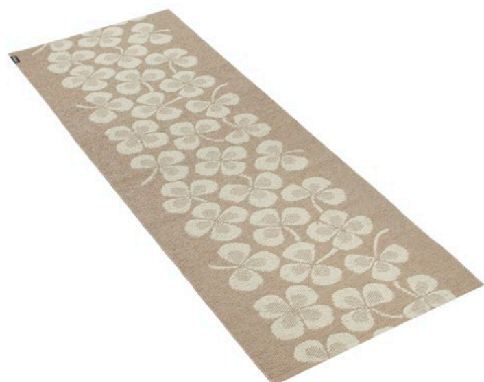
328, 329, 330 - Brown