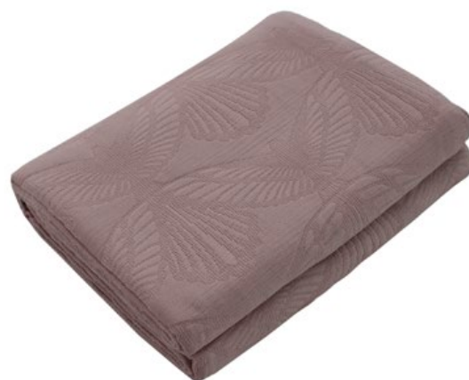
217 - Dusty pink