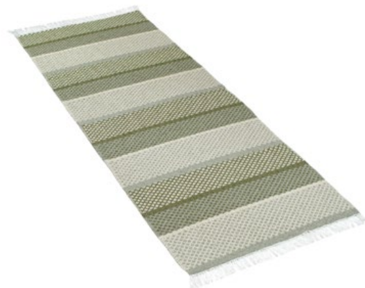
356, 357, 358 - Green/creme