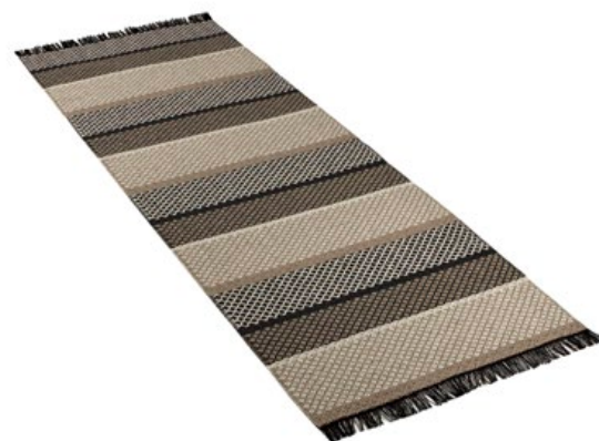
228, 229, 230 - Taupe