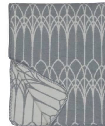
324 - Steel grey