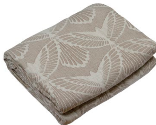
326 - Ecru/brown