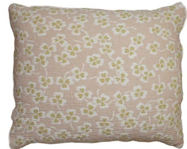
309 - Pink/yellow