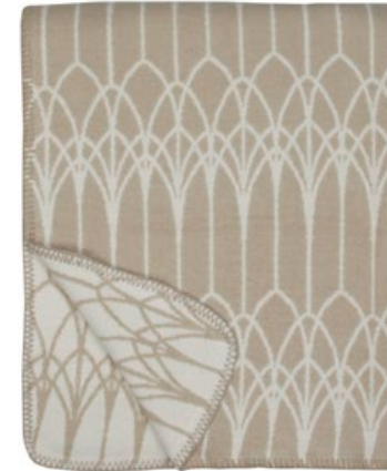
325 - Beige