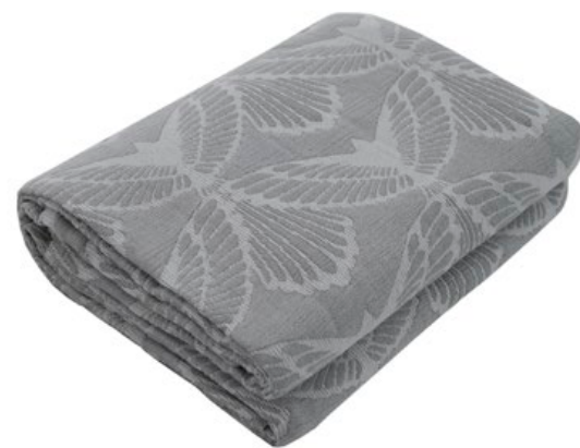
216 - Ecru/grey