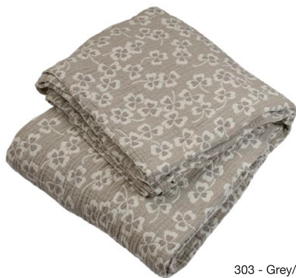
303 - Grey/beige