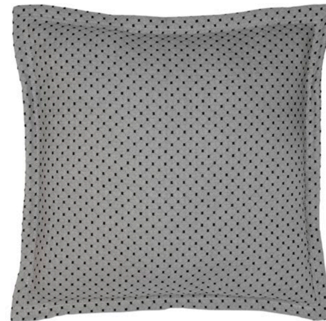
312 - Grey