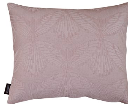
220 - Dusty pink