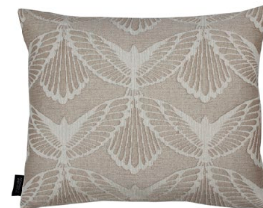
327 - Ecru/brown