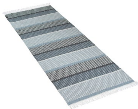
353, 354, 355 - Blue/grey