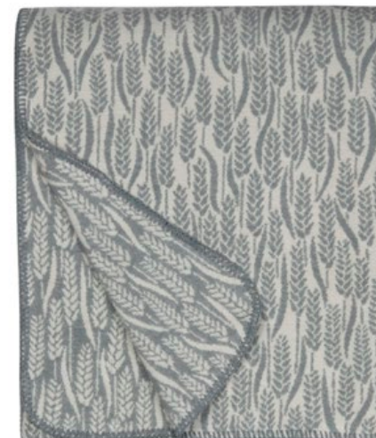
288 - Grå