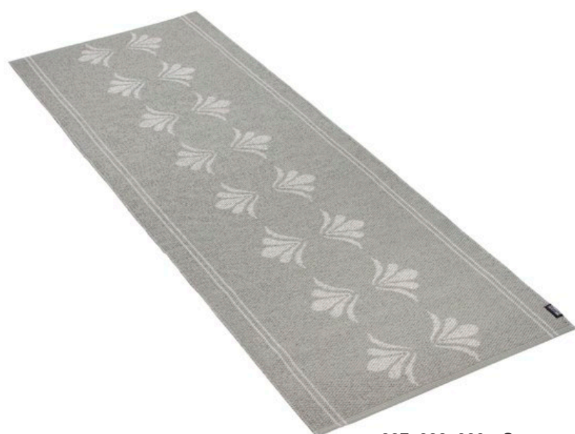
337, 338, 339 - Grey

Material: Non-toxic PVC made in Sweden, polyester warp Sizes: 70x150cm, 70x200cm, 70x275cm Woven in Sweden.