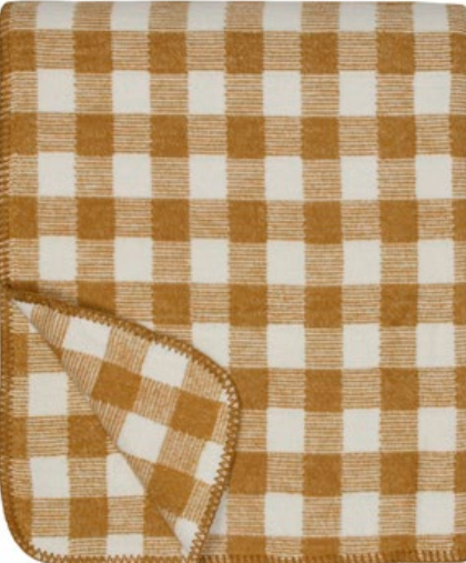
351 - Rust brown

Material: 100% cotton Size: 140x180cm Woven in Portugal Brushed cotton Oeko-tex standard 100 certified