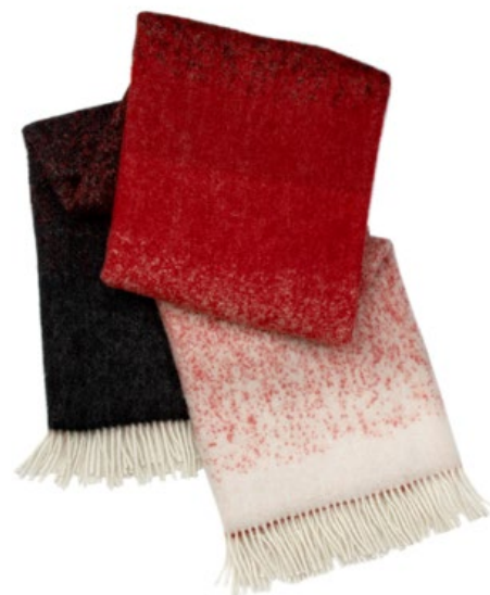
365 - Red