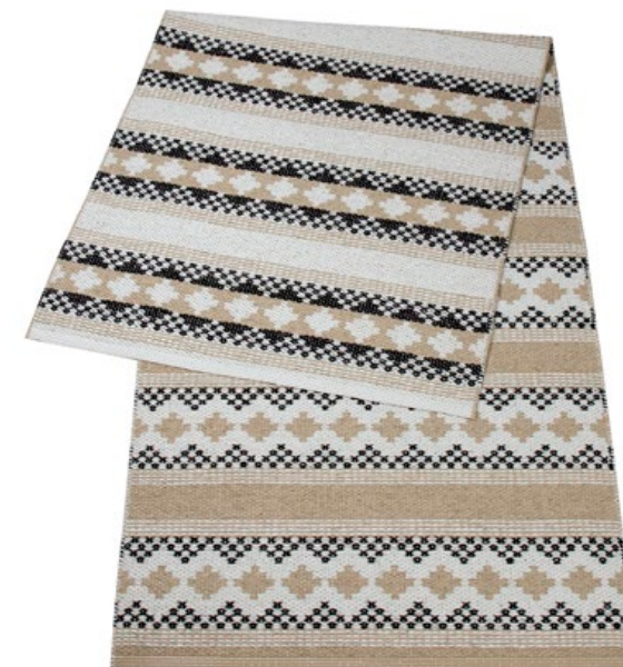
300, 301, 302 - Light brown