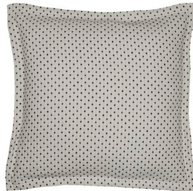
311 - Creme