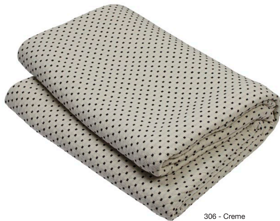
306 - Creme