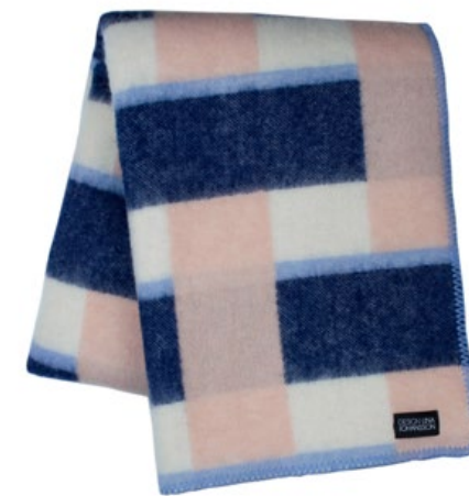
362 - Navy/pink