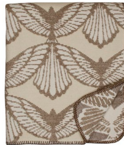
313 - Beige