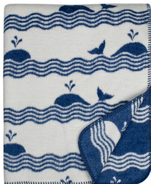
360 - Blue/white