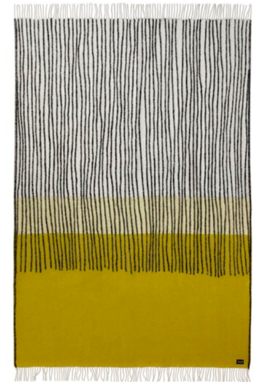
287 - Yellow