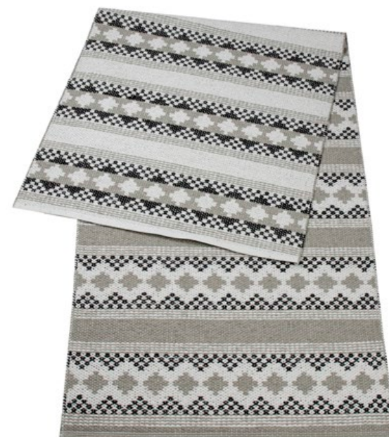
291, 292, 293 - Warm grey