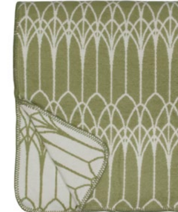
321 - Khaki green