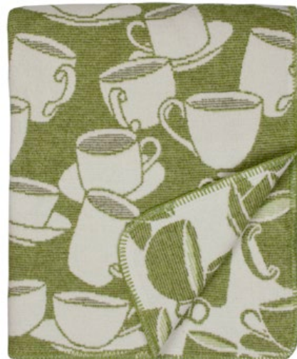
316 - Olive green