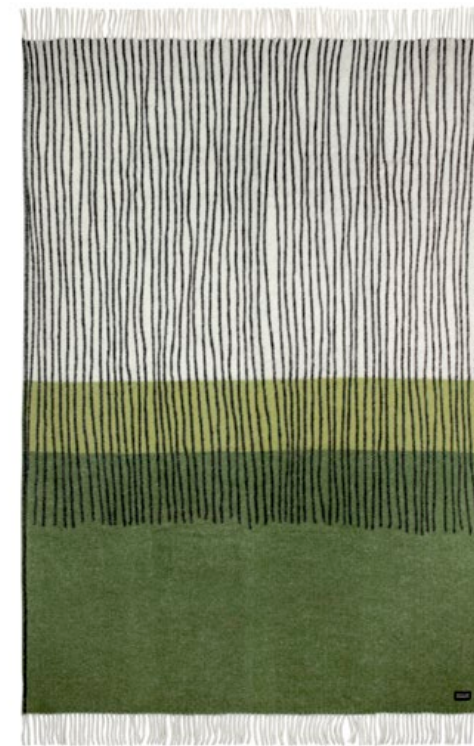
243 - Green