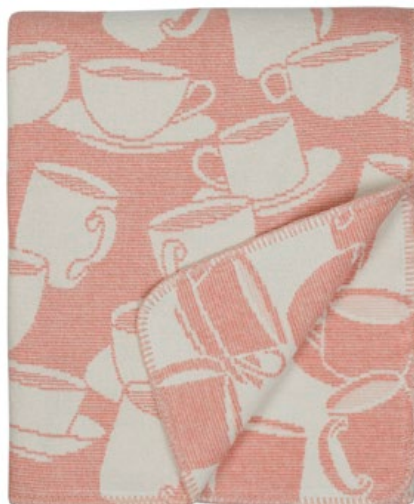
319 - Coral pink