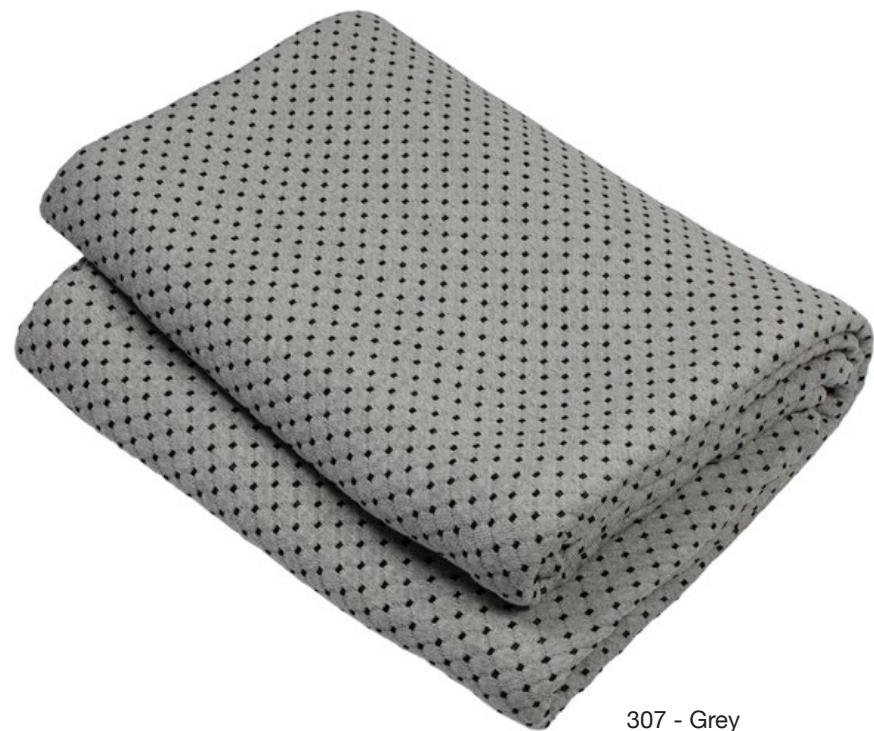
307 - Grey