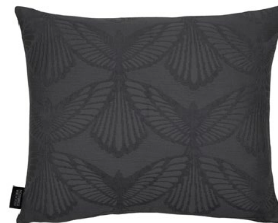
258 - Dark grey