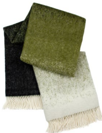
366 - Green