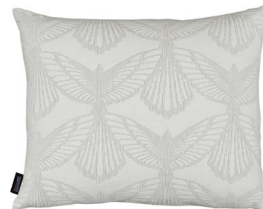
218 - Ecru