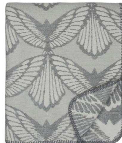
314 - Grey