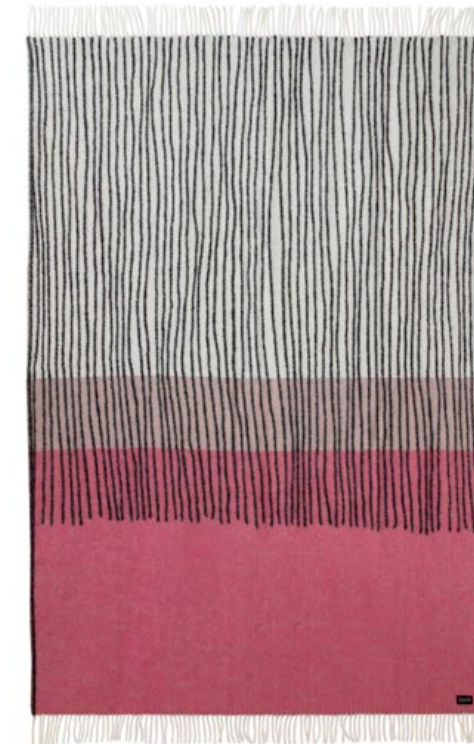
286 - Pink