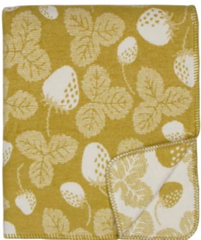
348 - Oil yellow

Material: 100% cotton Size: 140x180cm Woven in Portugal Brushed cotton Oeko-tex standard 100 certified