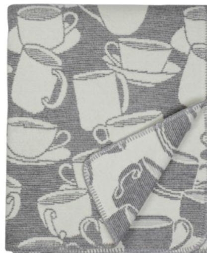
318 - Grey