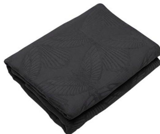
257 - Dark grey