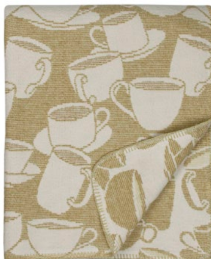
317 - Beige