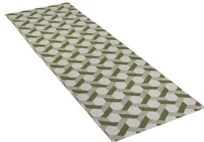
343, 344, 345 - Ecrú/green